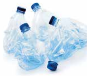
8 The result

Filled liquid containers are conveyed automatically from the funnel via the conveyer to the machine.