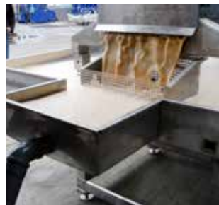
7 Separation of liquids

The funnel is used as a collecting hopper for large quantities of material.